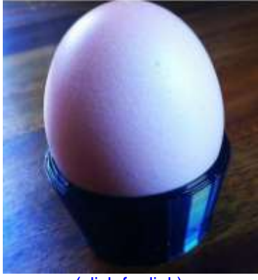
(click for link)

Look at this amazing article from the Atlantic. The author so drunk with possibilities that he's giving advice to Apple, no less, reveals the magic he created at home: An Egg Cup!